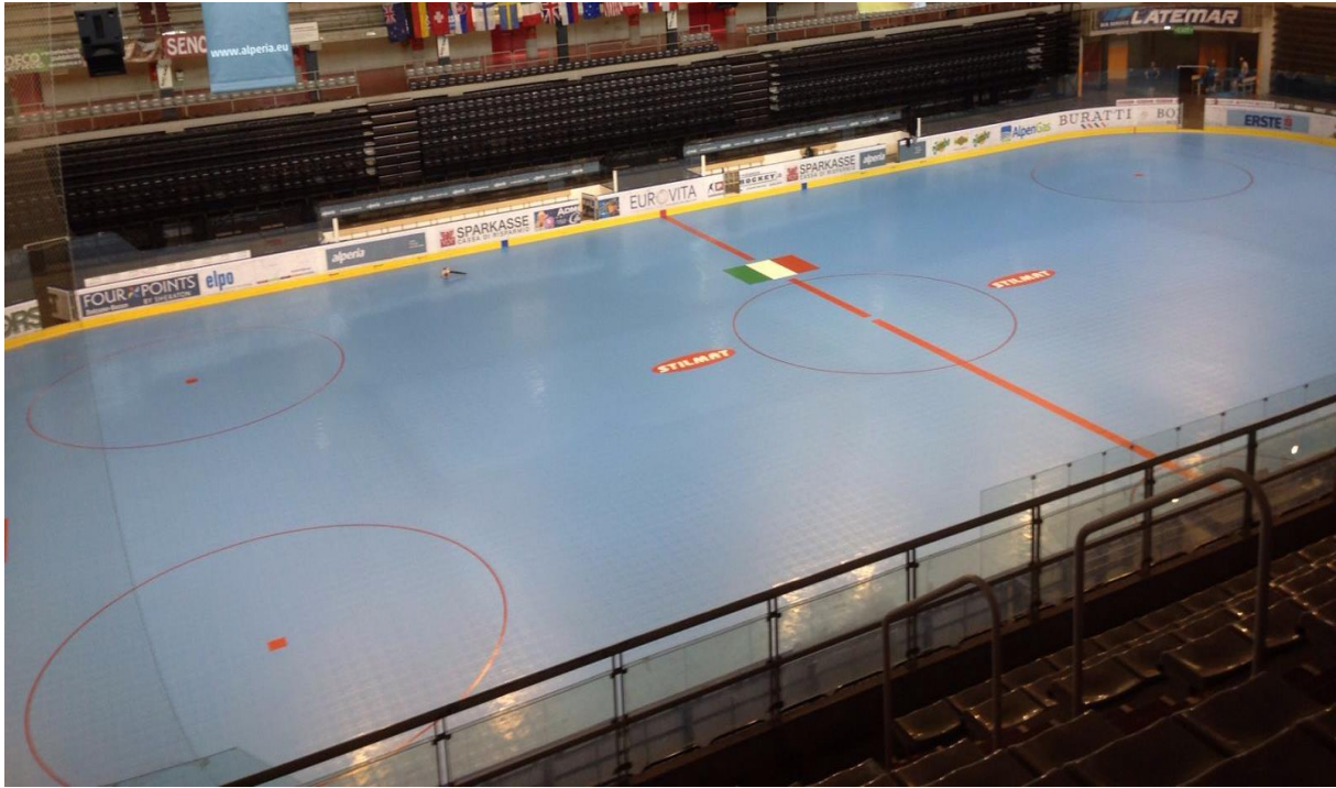
Instlation Bolzano, Italy- World Cup Masters 2016