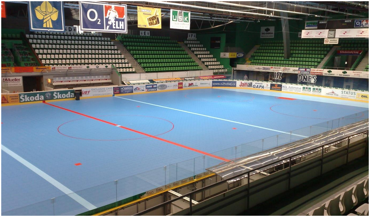
Installation Mladá Boleslav, Czech Republic