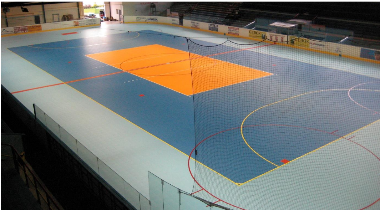
Installation Nový Jičín, Czech Republic