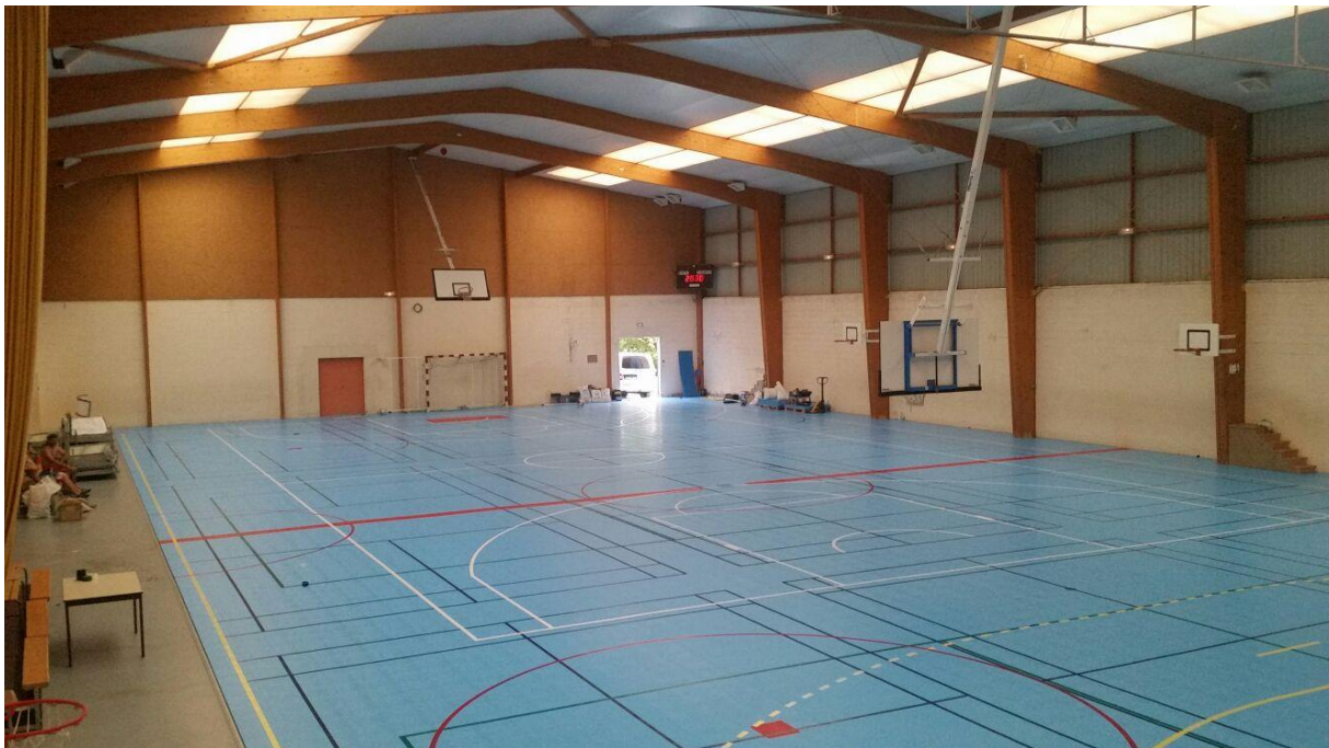
Installation Nantes,France- high school gym